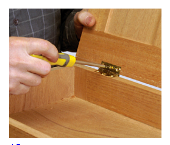
13 Use a router and chisel to cut the hinge mortises. Then, secure the hinges to the case and lid.

snug, open the side grooves by carefully sanding. Apply wax to both the guides and drawer sides after finishing to help the drawers slide smoothly.