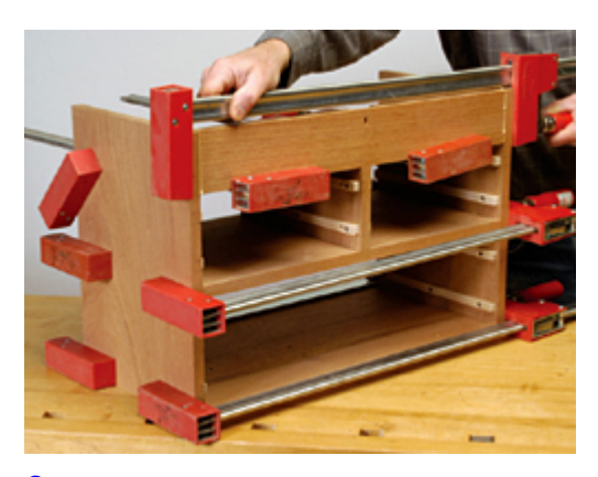
9 Apply glue to the dado/rabbet joints, join the sides to the shelves and rail, and install clamps.