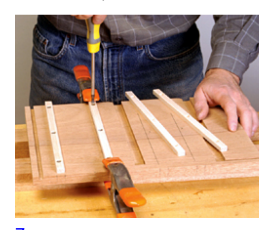
7 Clamp the drawer guides to the sides. Bore and countersink screw-holes, and secure the guides.