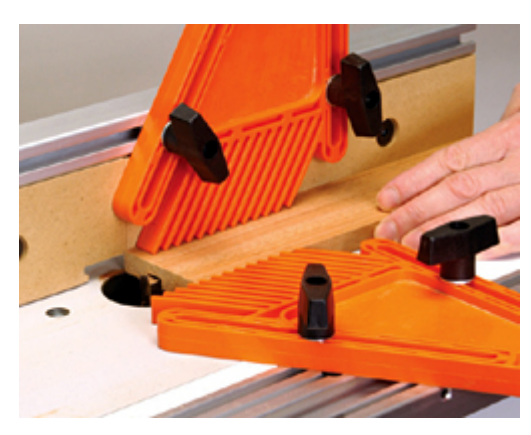
11 Install a 1/2-in. straight bit in the router table and cut the grooves for the drawer guides.