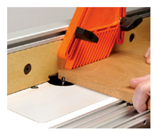
1 Use a 1/4-in. bit and router table to cut the dadoes in the chest sides for the bottom panel.

The joints for the middle and top shelves, as well as those for the partition, are also stopped dado joints. The easiest way to cut these is to use a router with a straight bit. Make a guide for the router by screwing a piece of straight 1/2-in.-thick stock to a wide base of 1/4-in. plywood. Mount a 5/8-in.-dia. bit in the router and run the router against the 1/2-in. stock to trim the 1/4-in. panel. Then, use this jig to position the router by aligning the cut edge of the panel with the dado layout line and clamping it in place (4). Square the ends of the stopped dadoes with a sharp chisel. Then, cut the notches at the front corners of the center shelf and partition with a backsaw.