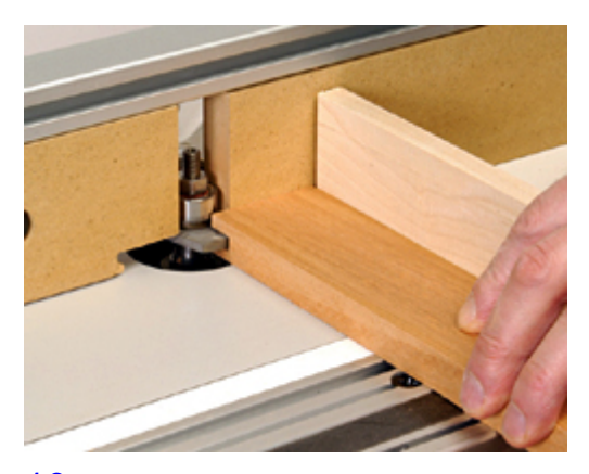
10 Use a 1/4-in. slot cutter in the router table to begin the drawer-face locking joints.