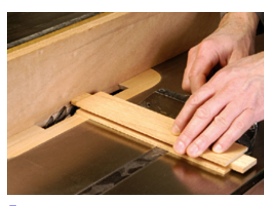
5 After routing the panel slots, cut the tenon cheeks with a dado blade. Board on fence acts as a stop.