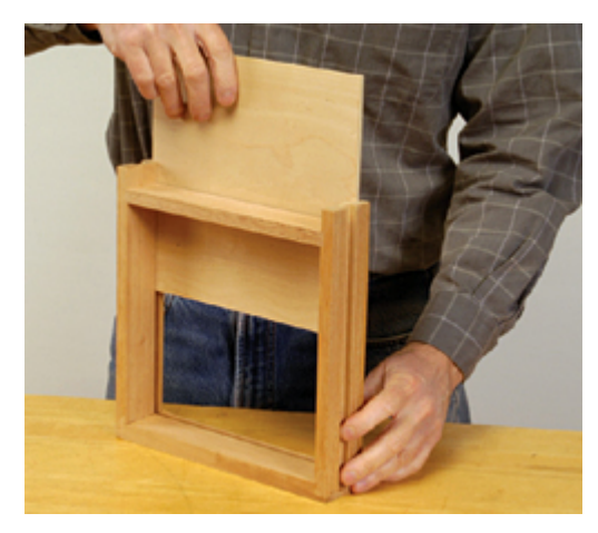
12 After assembling the drawers, cut bottoms to size, slide them into place and secure with screws.