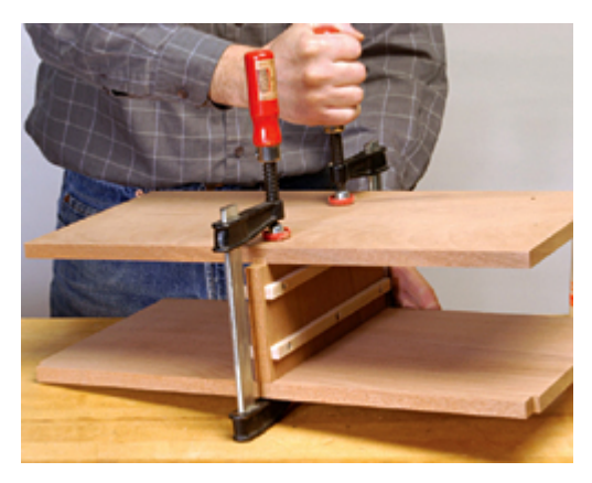
8 Begin case assembly by joining the partition to the top and center shelves. Clamp until glue sets.

tenon cheeks. Take care to keep glue from the panel grooves so the panels are free to move with changes in humidity. Join the mullions to the bottom rail and then slide the panels into position. Position the top rail over the tenon ends, then slide the stiles onto the rail tenons. Apply clamps and check that the assembly is square. Let the glue cure for at least 1 hour, and assemble the chest lid in the same way.