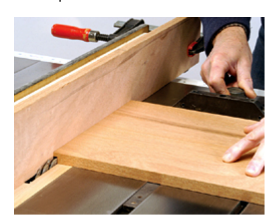
2 Cut the rabbet in the bottom panel with a dado blade. The blade extends into board clamped to fence.