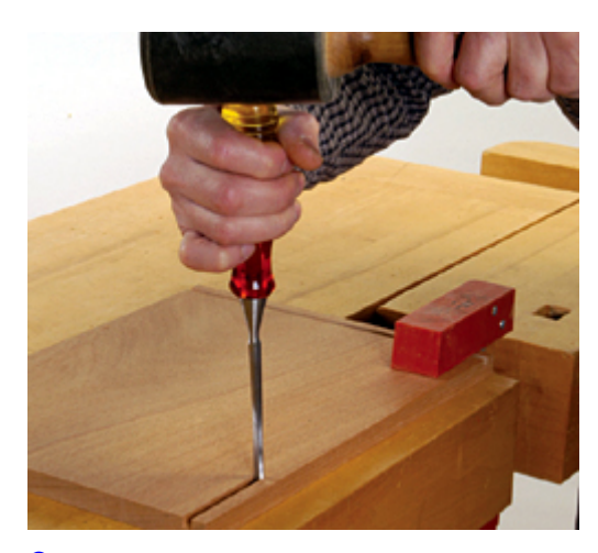
3 After routing the stopped slots for the front-rail joints, use a sharp chisel to square the ends.