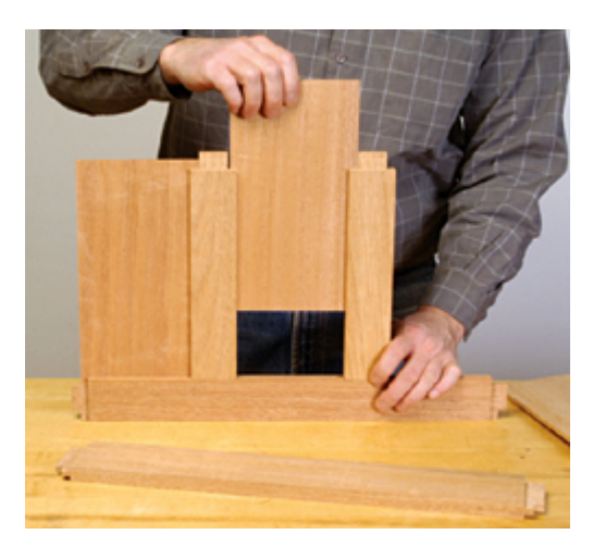
6 Dry assemble the back and lid parts to test fit. Sand the panels to 220 grit before actual assembly.