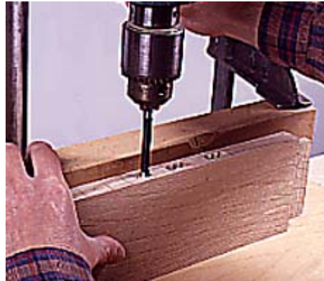
4--Cut the slat mortises in the rails using a drill press to remove most of the waste and a sharp chisel to finish the cuts.

Lay out the joining plate slots on the bottom shelf and side rails. Use the plate joiner to cut the slots in the shelf ends, registering the cut on a flat workbench or on the top of your table saw (Photo 5). To cut the slots in the side rails, you must use a spacer block under the plate joiner to yield the proper slot position (Photo 6).