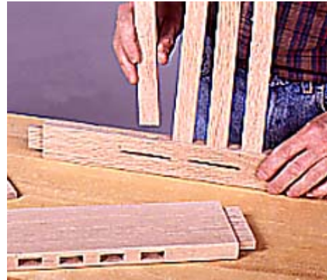
7--Test fit the side slats in the rail mortises. Sand or trim the joints, if necessary, to achieve a tight fit for each slat.