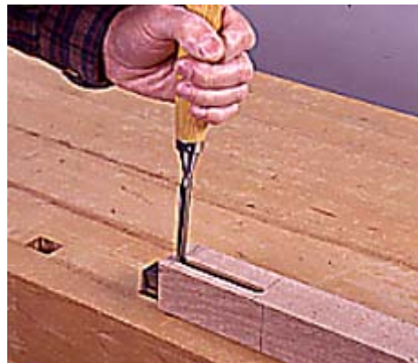
2--When the routing is done, carefully square the ends and flatten the sides of each mortise with a sharp chisel.