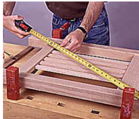
8--Apply glue to the mortises and tenons, then clamp the parts. Check for square by comparing diagonal measurements.