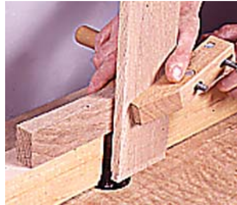
14--Use the same dovetail bit in a router table to cut both sides of the dovetails on the ends of each drawer side.

Cut the drawer hanger strips to size, then bore and countersink pilot holes for attaching them to the drawer sides. Clamp the strips to the drawer sides, then fasten them with screws (Photo 17). Finish the drawer assembly by marking the locations of mounting screws for the drawer pull. Bore pilot holes and attach the pull.