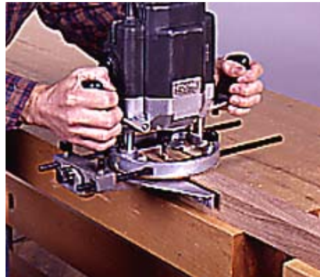
1--Use a router with an up-cut spiral bit and an edge guide to cut the rail mortises in the table legs. Make several passes.