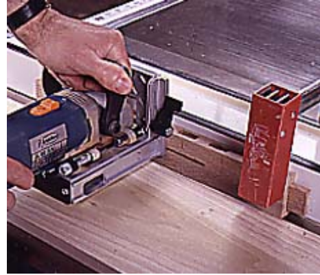
6--Clamp the bottom rails to your table saw fence. Then use a plate joiner to cut joining slots in one side of both rails.

Use a router with an edge guide to cut a 1/4-in.-deep x 3/4-in.-wide dado in each drawer guide (Photo 11). Bore and countersink pilot holes for mounting screws in the guides, then sand the guides with 220-grit sandpaper before fastening them to the table legs (Photo 12).