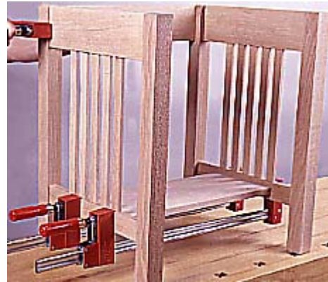
10--Clamp the side assemblies to the back rail and shelf and check the parts for square. Readjust the clamps if necessary.

Mark the locations of the tabletop fasteners on the top edge of the side and back rails. Use a 3/4-in. Forstner or multispur bit to bore the 1/8-in.-deep recess for the fasteners. Bore a pilot hole for each, then attach the fasteners with 1-in.-long No. 8 fh screws.