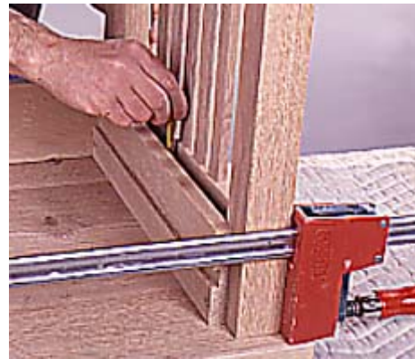
18--Center the base over the top and mark the fastener holes. Then bore pilot holes in the top and attach the base.