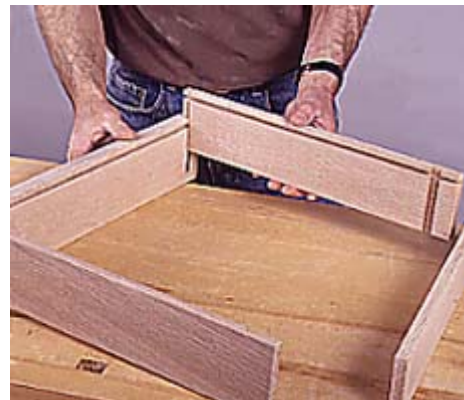
16--Apply glue to all the drawer joints, then clamp the box together. Reinforce the side-to-back joints with brads.