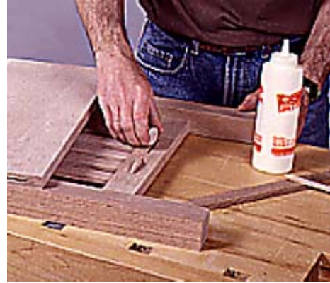
9--To join the sides to the back rail and bottom shelf, apply glue to the slots and plates, and to the mortises and tenons.