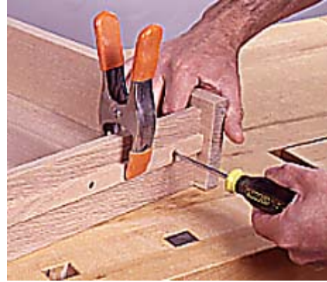
17--Slide the drawer bottom in place and attach it to the back with screws. Also, screw the guide strips to the sides.