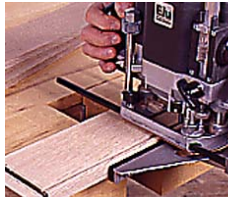
15--Cut a dado between the dovetail slots on the drawer face for the bottom panel. Cut matching dados in the drawer sides.