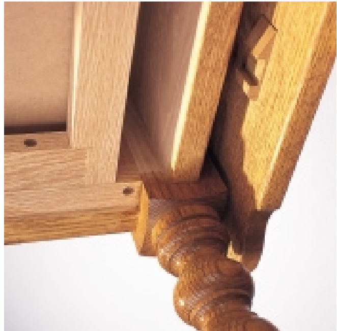
The view from underneath, showing the leg, skirt and drawer undercarriage assembly. You can turn your legs, or buy them factory-made, as long as the square ends are at least 7" long

I planed my own 1"-thick rough oak for this table, creating the \frac{7}{8} " stock used for most parts. This thicker-than-standard stock looks much better than regular \frac{3}{4} " material for this project, and it even costs less if you begin with rough lumber bought directly from a mill. This is just one advantage of owning a thickness planer