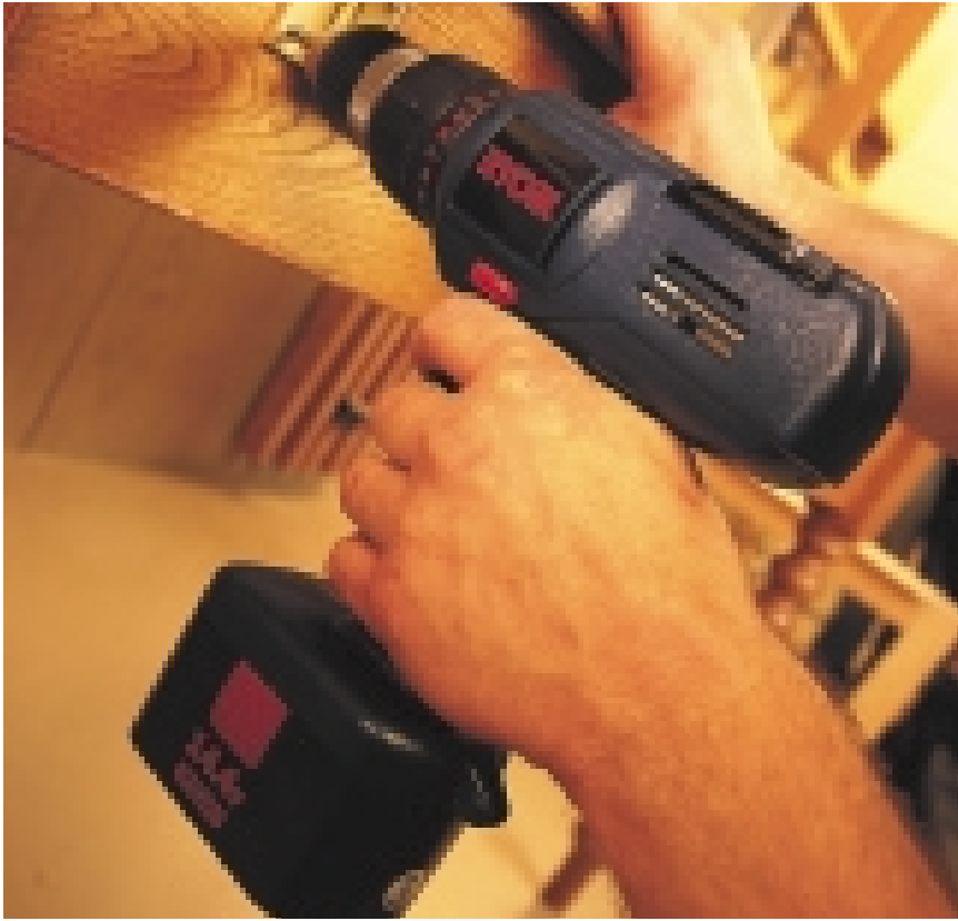
A 14-volt cordless drill has plenty of power to drill the pilots and drive the screws for the support-wing hinges (shown here) and the special drop-leaf hinges