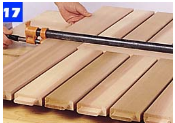
Glue and clamp a side rail to the center rail. One clamp, carefully centered, should provide enough force.

Using this technique, you will not have to worry about getting all the parts together before the glue begins to set. Your results will be better, and the stress of a frantic assembly is eliminated.