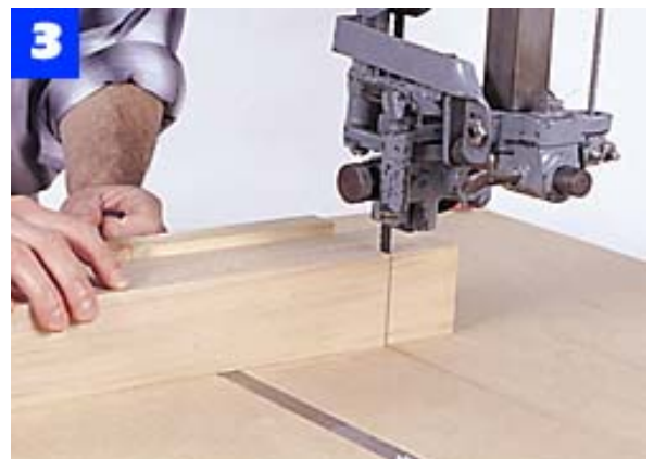
Crosscut the legs on the band saw. Here, a shopmade crosscutting table and a miter gauge are used to make the cut.

Since the bench legs are smaller than the table legs, it is a better use of materials to glue them up from three pieces of 3/4-in.-thick stock. You can simplify the job if you plan to make the blanks large enough to cut four legs from each glued-up stack.