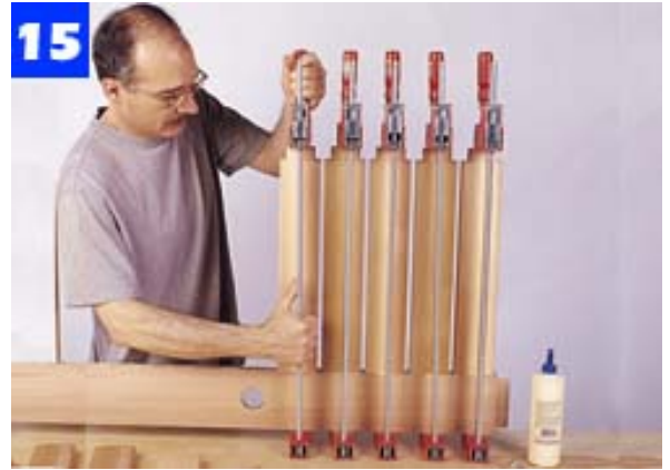
Multiple subassemblies are made in assembling the tabletop. First, slats are joined to the center rail.

Approach the tabletop assembly in the same manner. Begin by gluing and clamping a slat at each end of the center rail. Fill in between these two slats with more slats ( Photo 15 ). When the glue is dry on this subassembly, glue and clamp slats to the opposite side ( Photo 16 ). Next, glue and clamp the side rails to this subassembly ( Photo 17 ). When the glue is set on that subassembly, position clamps across it and then glue and clamp one stile to it ( Photo 18 ). Complete the top by gluing and clamping the second stile.