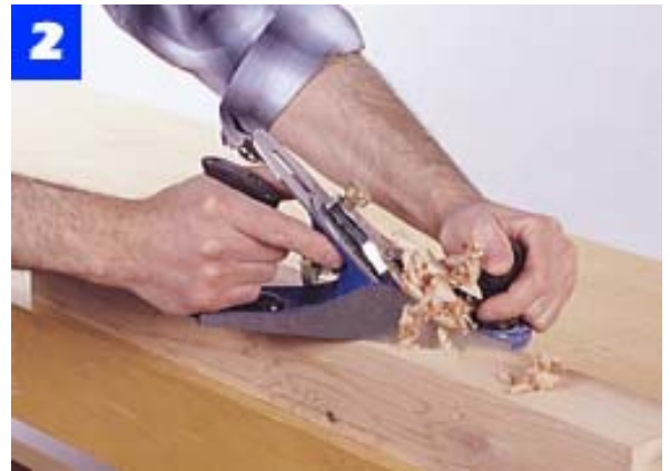
Clamp a table leg to a benchtop and remove saw marks with a hand plane. To make a smooth cut, push the plane at an angle.

Use a miter gauge on the band saw to crosscut the leg blanks to finished dimension ( Photo 3 ).