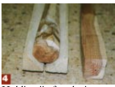
Holding jig for planing