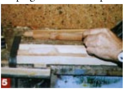
Planing in the jig