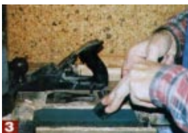
Keeping the blades sharp