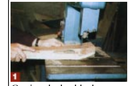
Cutting the leg blank

S. L. Hardwoods - Quality Timber Stockist