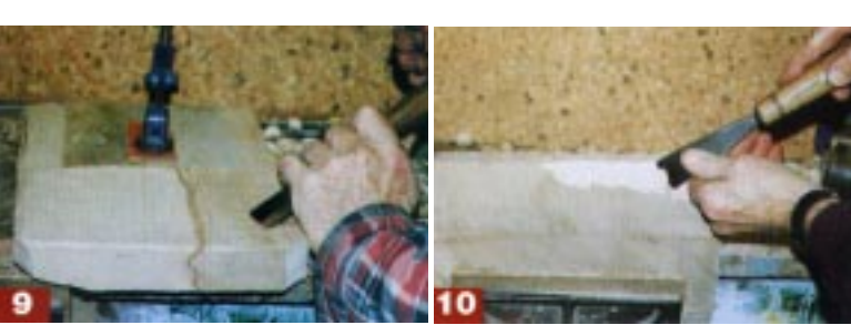
Using the chisel across the Bottom edge grain