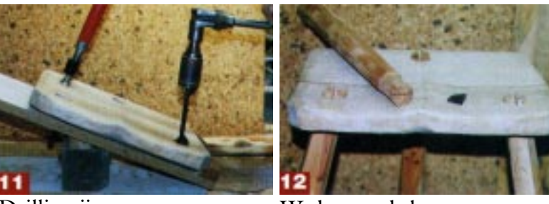
Drilling jig Wedges and slots