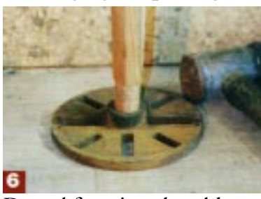
Dowel forming the old way